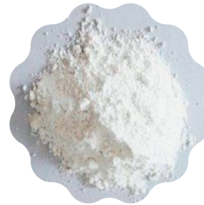
Natural Calcium Carbonate Calcite Powder