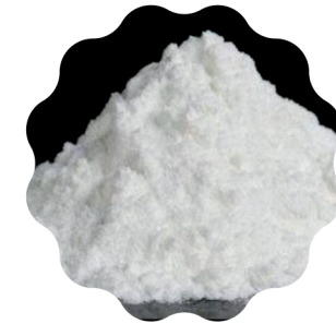
Micronized Calcium Carbonate Powder